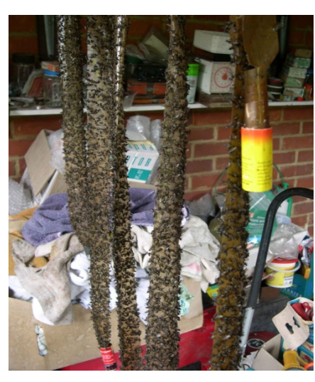
Fig 4: Adhesive Traditionally, long adhesive fly papers are fly papers in a used, available from DIY or farm supply resident's stores. They're cheap, easy to use and catch home (Copyright C. flies well, although they can be difficult to handle and store after use. Single-sided adhesive fly papers should be transported in cardboard boxes and can then be stuck on white paper to identify (where possible) and count flies.

Officers should take photographs of papers as they may be required for evidence. Fly papers should be replaced weekly throughout the infestation, and continue to be used after numbers have dropped so that 'usual' numbers can be recorded. For enforcement cases it is essential to be able to state what is 'usual' in that area. Experience has shown that fly papers can attract up to 500 flies, and that a number of 50 or more of one species in a week indicates a significant breeding ground nearby.