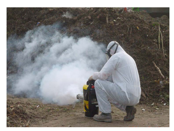
Fig 8: Thermal fogging at a green waste composting site

Some insecticides are approved for use as space sprays, where the liquid insecticide is atomised into very fine droplets that drift in the air and contact flying insects directly.