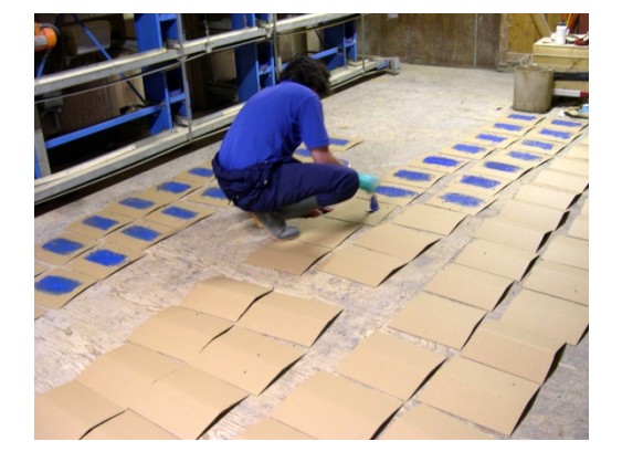
Fig 10: Preparing insecticide fly bait cards

Insecticide baits typically consist of a mixture of insecticide, sugar and pheromone attractants. They are most commonly mixed to a paste and painted onto sheets of cardboard which are nailed up within the premises, or painted directly onto structural surfaces such as supporting posts, where flies commonly rest. Once applied, the bait will normally last some weeks or longer, but may need re-applying where large numbers of flies are present.