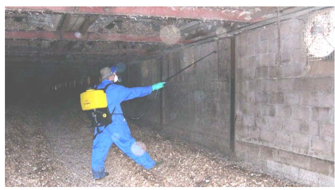
Fig 9: Applying residual insecticide for fly control

Some insecticides are intended for use as a residual spray and are applied to surfaces using a hand-held compression or pneumatic sprayer. They leave a deposit that remains active for some days or weeks. Flies that subsequently alight on the treated surface pick up a lethal dose of the insecticide and are killed. They typically contain residual pyrethroids or a carbamate. If operators turn or agitate the mateiral they'll need to reapply the insecticide.