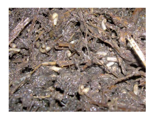
Larvae of common housefly in wet manure (larvae of blowflies appear similar)