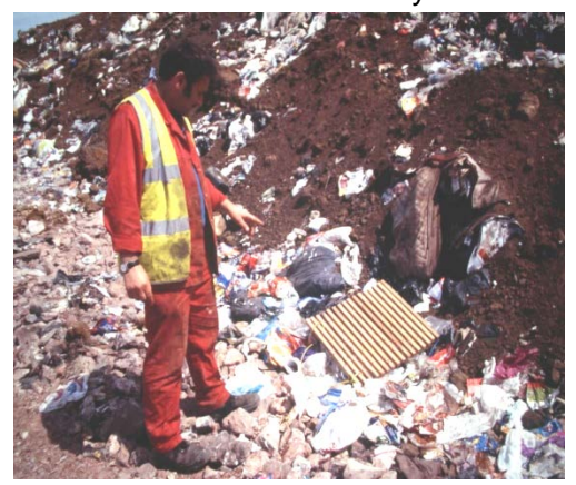
Fig 3: Scudder Grid in use at a landfill site

A Scudder grid is a standard 60cm square wooden slatted grid which is dropped onto the surface of the refuse. After a period of 10 seconds, the flies resting on the grid are quickly counted and recorded; these are likely to include common housefly and bluebottles, so an element of identification is necessary.