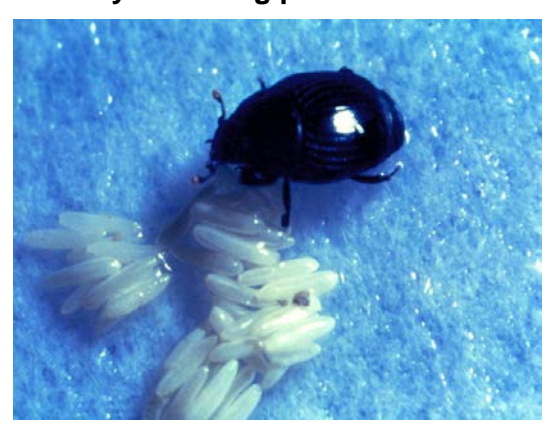
Fig 5: Carcinops pumilio feeding on housefly eggs

Within manure in poultry houses there are often a number of housefly predators present naturally. These include the small mite Macrocheles muscaedomesticae which preys on fly eggs, the beetle Carcinops pumilio which feeds on housefly eggs and larvae, and Staphylinid beetles.