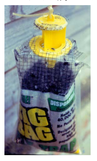
Fig 7: Liquid baited fly trap

These traps are suitable for: More effective with smaller fly numbers in smaller enclosed areas, e.g. egg packing room, office, etc.