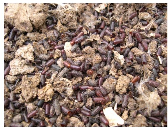
Pupae of common housefly in dry manure (pupae of blowflies appear similar)